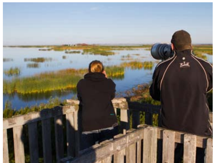
Quill Lakes International Bird Area.

For an alternate route to Regina, return west to Elfros on Hwy 16 and follow Hwy 35 south for 111 km to Fort Qu'Appelle in the scenic Qu'Appelle Valley, then take Hwy 10 for 49 km to Balgonie and travel 28 km west on Hwy 1 to Regina. After a busy day of exploring Saskatchewan's ornithological treasures, this evening you will rest and recharge in Regina.