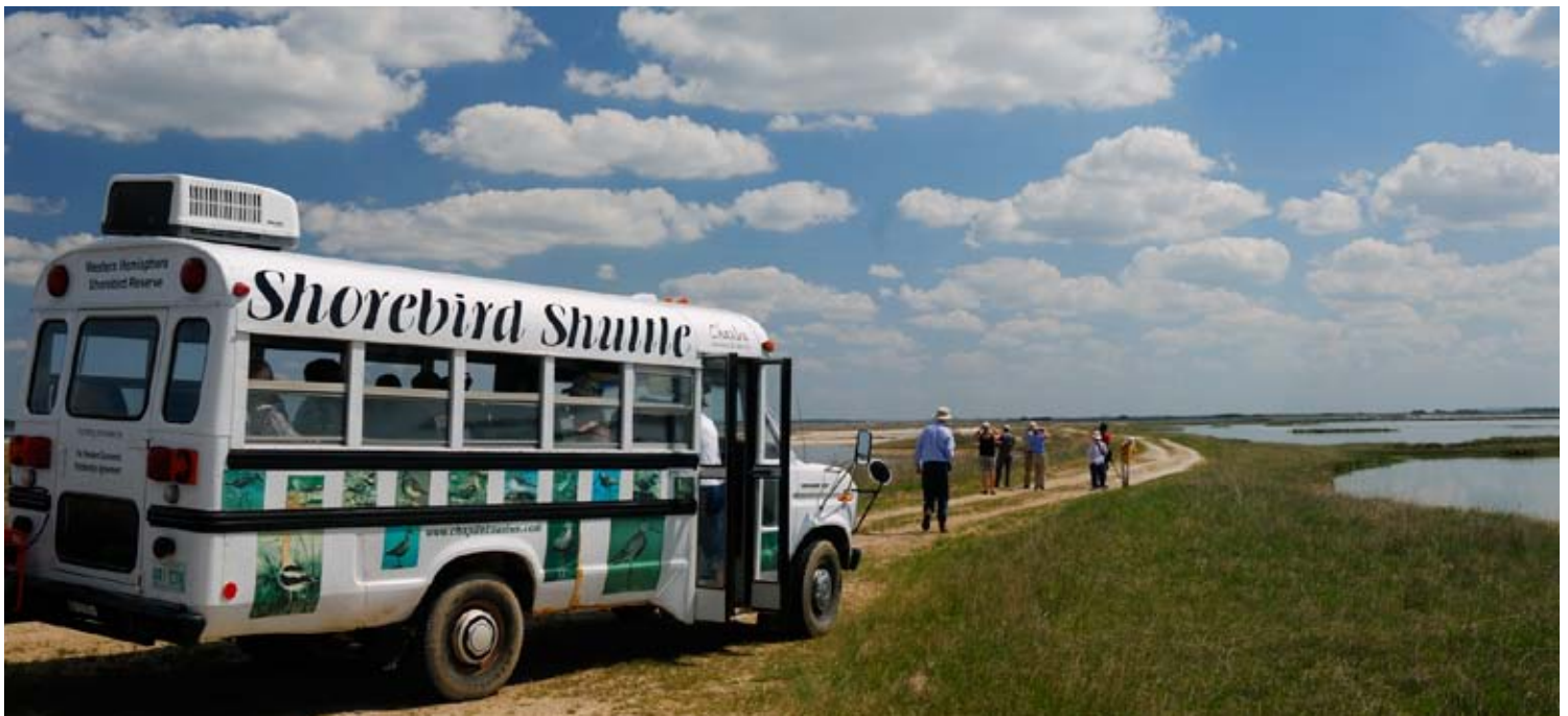
Shorebird Shuttle Tour, Chaplin Lake.