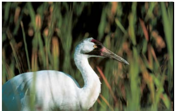
Whooping Crane.

From Regina, travel 33 km northwest on Hwy 11 to Lumsden, then north on Hwy 20 for 81 km along the scenic Qu'Appelle Valley and east of Last Mountain Lake to Govan. Continue 11 km north of Govan on Hwy 20 to the sign for the Last Mountain Lake National Wildlife Area (NWA) and Migratory Bird Sanctuary. Turn west on Grid 748 and continue through the PFRA pasture until the road ends, then take the speed curve north and follow the road for 3 km, and turn west at the first corner. Follow the road 6 km to a four-way intersection with sign denoting the NWA Headquarters, then turn south and travel 3 km to the site.