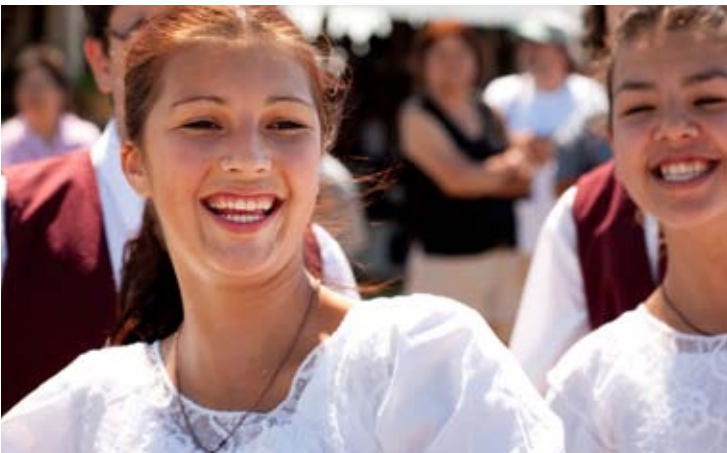
Dancer, Back to Batoche Festival.

An afternoon of cultural immersion is in store at Wanuskewin Heritage Park, located 5 km north of Saskatoon off Hwy 11 (watch for buffalo signs). This award-winning 760-acre heritage park is a place of cultural significance, having been a meeting place for Northern Plains Indians for over 6,000 years. Outdoors, explore the beautiful valley through which the tranquil Opimihaw Creek flows. Interpretive trails, tipi rings, bison kill sites, medicine wheel, summer camping grounds and archaeological digs are yours to discover. The reality of pre-contact civilization on the prairies is brought to life inside the interpretive centre which includes an art gallery, guided walks, gift shop and a restaurant featuring First Nations cuisine with a modern flair.