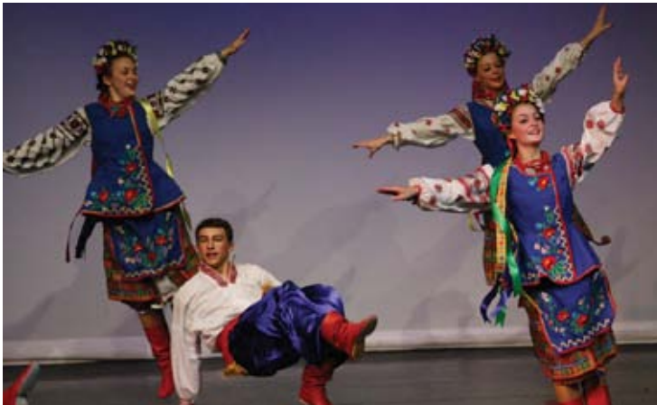
Traditional Ukrainian Dancers. Tourism Saskatchewan

For the night, head 40 km northeast via Hwys 5 and 57 to Duck Mountain Lodge located inside Duck Mountain Provincial Park. This beautiful cedar lodge overlooks Madge Lake and features an indoor pool, whirlpool and fireside lounge. For supper, it's worth the 50-minute drive north to Norquay to have some Ukrainian classics like kovbasa and varenyky (perogies) at the Whistle Stop Restaurant, located in a former Canadian National Railway station.