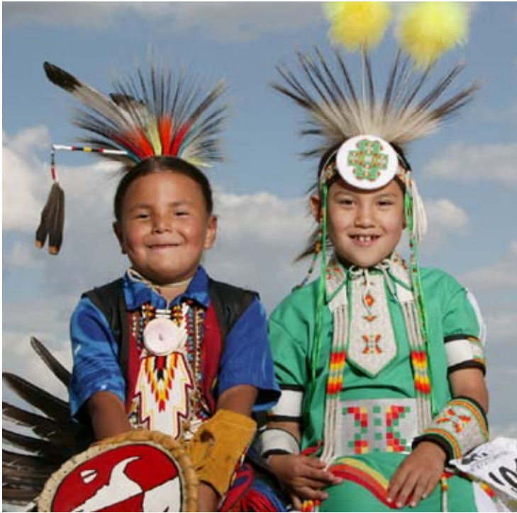
First Nations Children at Wanuskewin Heritage Park.

If you're feeling adventurous, consider booking an overnight tipi stay at Wanuskewin. Nestled in a cozy tipi in the Opimihaw Valley with bison stew on the fire and bannock slung over a roasting stick, you will be enveloped by a sense of understanding and peace. You'll drift off to sleep with the earthen smell of the tipi surrounding you. This experience of a lifetime only concludes in the morning, when the smell of muskeg tea greets your senses and memories of your unforgettable night in a tipi start to solidify. Overnight tipi stays must be pre-booked at least six days in advance by calling 306-931-6767, Ext. 245.