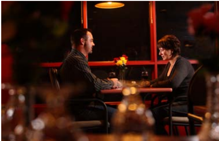
Dining, Manitou Springs Hotel & Mineral Spa.

Start your day off with a leisurely dip in the roof-top mineral pool, where you can wade to the outside area for a panoramic view of the city while remaining submerged in the warmth of the water. Pamper yourself with a visit to one of Moose Jaw's spas. A massage is just moments away at Temple Garden's Sun Tree Spa; simply rise from the pool, wrap yourself in your robe and let the world fall away. The exotic and decadent Sahara Spa, featuring ancient healing rituals and Asian spa therapies, is located nearby in an elegantly restored Canadian National Railway station. Sahara Spa's treatments will transport you to distant lands, if only for a short time.