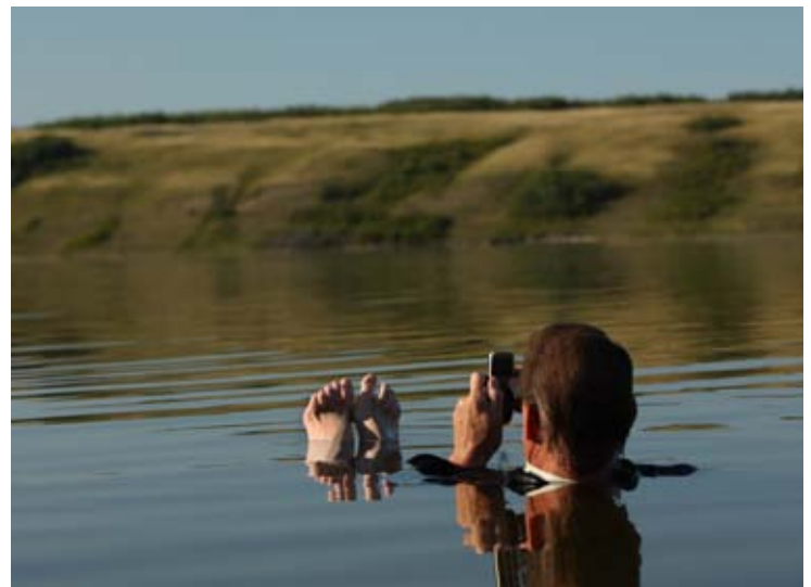
Floating on Little Manitou Lake.

After two rejuvenating days in Moose Jaw, head out onto the wide-open prairie as you travel to the Resort Village of Manitou Beach. Journey 156 km north of Moose Jaw on Hwy 2, turning right on Hwy 365 east of Watrous for a short distance to reach Manitou Beach. On the way, be sure to stop at the Last Mountain Lake National Wildlife Area, home to the oldest bird sanctuary in North America. Boasting over 280 species of birds including the peregrine falcon, piping plover and whooping crane, you'll want to go for a hike, have a shoreline picnic or take some time for a photography session in this pristine nature preserve. The bird sanctuary is open May through October, and can be accessed via a grid road off Hwy 2 at Simpson (watch for signs).