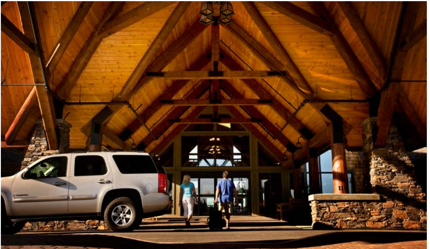
Elk Ridge Resort.

Waskesiu townsite in the heart of PANP has an expansive beach, unique shops, summer eateries and ice-cream stands. Spend some time experiencing the freedom-filled summer-camp atmosphere. Finish your day on the beach by watching a spectacular sunset place its colourful spell on the water's surface – the perfect way to conclude this journey of wellness and relaxation.