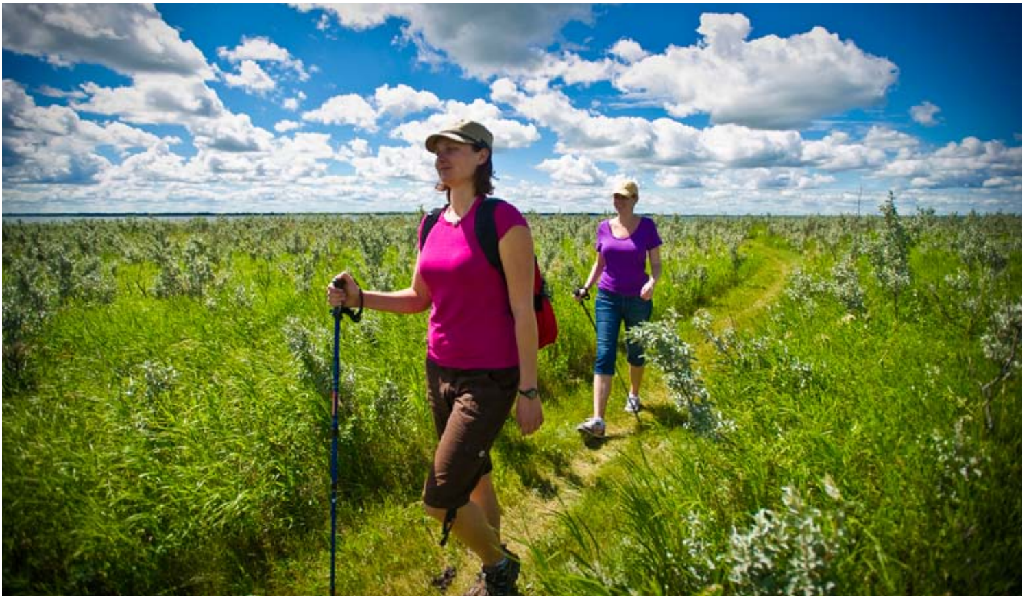
Hiking, Douglas Provincial Park.

The first day of this circle tour takes you to the town of Elrose, 80.5 km south via Hwys 15, 42 and 44. The town of Dinsmore, 3 km east of the junction of Hwys 42 and 44, makes a good stop for lunch in a restaurant or a quiet park. If you visit on a Thursday morning from May through September, the Dinsmore Market event is held in the community hall featuring produce, baking and local crafts. Elrose is located on Hwy 4 about 4 km south of the junction of Hwys 4 and 44. Camp overnight at Elrose Regional Park located at the south end of town next to the UniPlex, or choose from fixed roof accommodations available in town.