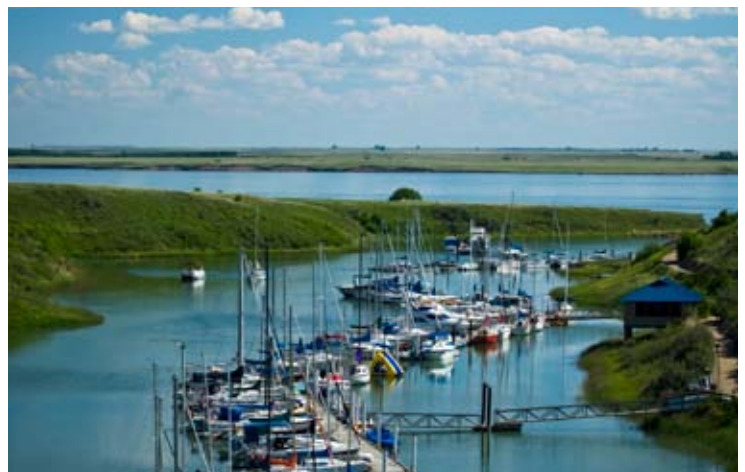
Elbow Marina.

Start from the Outlook and District Regional Park, located in the scenic South Saskatchewan River valley below the SKYTRAIL, Canada's longest pedestrian bridge. Take some time to appreciate the magnificent views from the SKYTRAIL which spans nearly a kilometre some 15 storeys above the South Saskatchewan River.