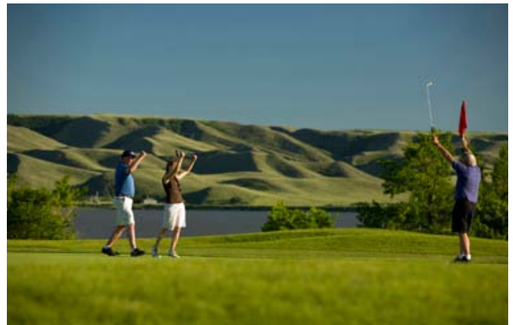
Saskatchewan Landing Golf Resort.

After cycling north out of the valley on Hwy 4, you'll reach the town of Kyle at 72.7 km. Stop in at the Kyle & District Museum at the east side of town. The town has most services including several restaurants and fixed-roof accommodation. There is also a restaurant and a hotel with cabins in nearby Clearwater Regional Park, 3.2 km north of Kyle on Hwy 4. For an unusual treat, take a short 6.5 km ride from the regional park to watch a movie under the stars at Clearwater Drive-in Theatre, one of Saskatchewan's few surviving drive-ins. Don't forget to pack your lights for the trip back to camp!